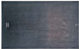
StepVIEW Mat Large Exposed 999- -

Presence-Sensing Automatic Locator Mat 44" x 27.5" (1.12m x 70cm) with attached 75' (22.9m) cable