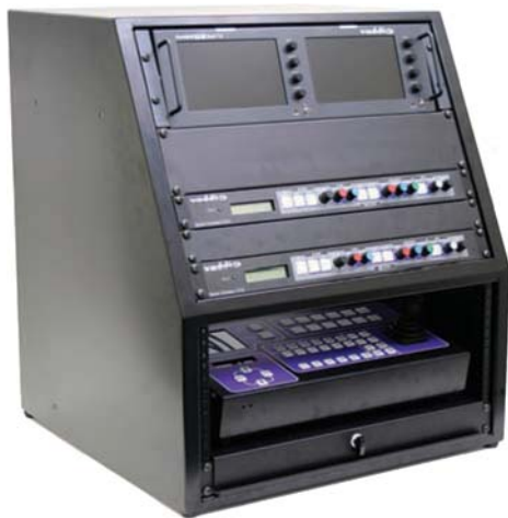
ProductionVIEW Rack Enclosure 998-5000-200