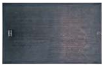
StepVIEW Mat Small Exposed 999-1511-000