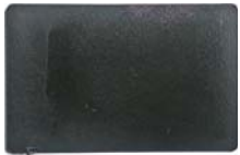
StepVIEW Mat Small Concealed 999-1611-000

Presence-Sensing Automatic Locator Mat 57" x 27.5" (1.45m x 70cm) with attached 75' (22.9m) cable