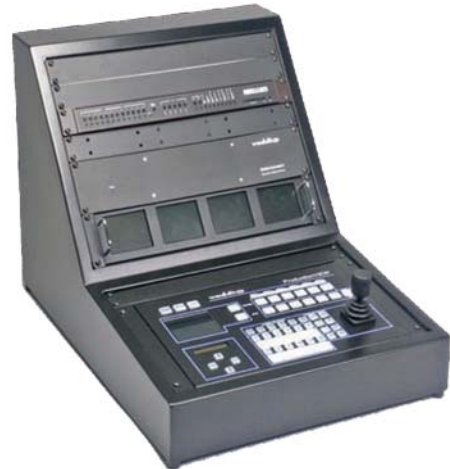
ProductionVIEW Rack Console 998-5000-100