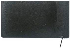
StepVIEW Mat Large Concealed 999-1612-000

Architectural Thin, Concealed Auto Locator Mat 45" x 21" (1.14m x 53cm) with attached 75' (22.9m) cable