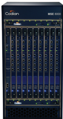
MSE 8000 Chassis

The TANDBERG Codian MSE 8510 Media2 blade is the industry's leading chassis-based, high-definition multimedia conferencing bridge. It delivers superior video and voice with an easy-to-use, versatile management interface. Compatible with all major vendors' endpoints, it maintains its capacity and performance in every configuration, delivering the best experience for each participant, every time.